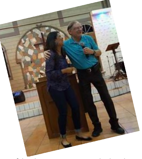
Beautiful audience response to medical student's testimony at conference.

If you would like to receive these reports by email every 6 weeks send an email to wgp@AbideInChrist.com and write "Send Mission Reports" in the subject heading.