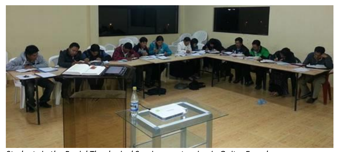
Students in the Peniel Theological Seminary extension in Quito, Ecuador.

I also spent a week teaching the course on the Gospels and Acts to Peniel Theological Seminary students at the Quito extension.