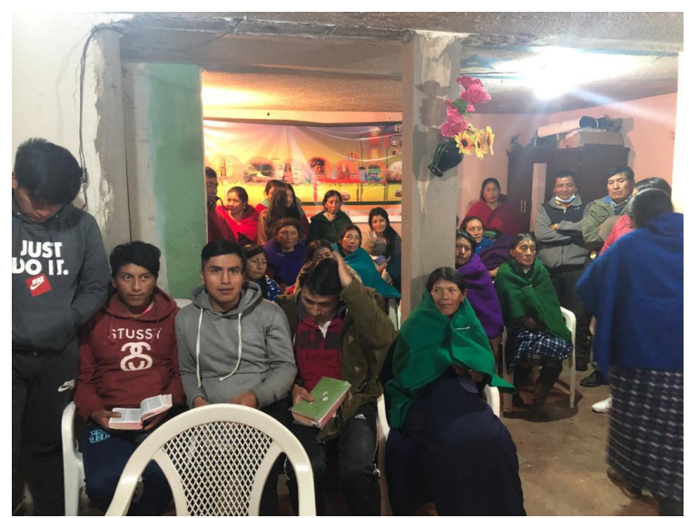
New believers at the San Juan de Guabug mission started by Peniel Seminary graduates.