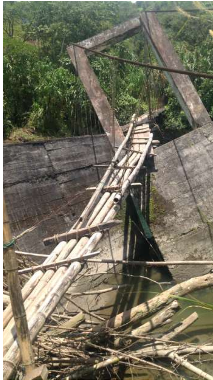
Above: Damaged jungle bridge near Kintia Panki