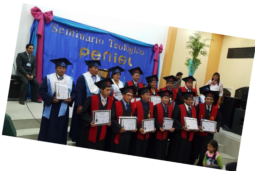
Wednesday night graduation at Peniel Theological Seminary