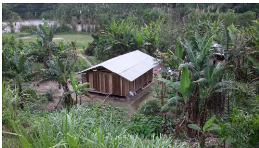
Ecuadorian jungle community needs Christ

We extracted teeth and witnessed in four areas where there is no evangelical work in this jungle area of Ecuador. Yes, we had a number of beautiful decisions for Christ