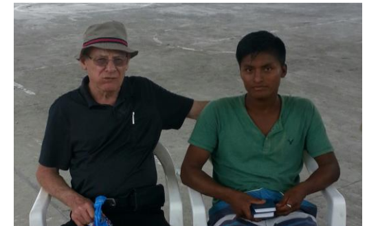
Wil with new believer in Christ.

Please continue to pray for these Quichua pastors from all over the country. The fields are indeed white unto harvest.