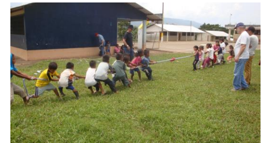
Abide in Christ team enjoying tug of war with Shuar children.

"I do not consider my life of any account as dear to myself, in order that I may finish my course, and the ministry which I received which I received from the Lord Jesus, to testify solemnly of the gospel of the grace of God.... For I do not shrink from declaring to you the whole purpose of God" (Acts 20:24, 27).