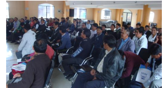
Part of the Peniel Theological Seminary Continuing Education Conference

I spoke on the Baptism of the Spirit and Sanctification. The question and answer period each day was very encouraging for the pastors and for me. It indicated they were focused on a solid Biblical theology.