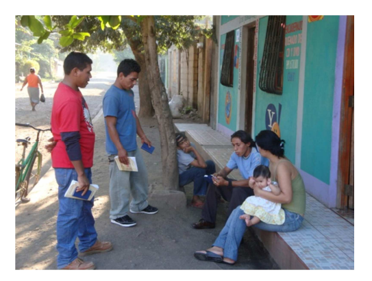
Member of EID workshop sharing Christ in San Juan.

daily. We praise the Lord for these new open doors to preach the gospel.