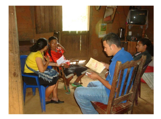
Evangelism in Depth participants are sharing Christ in a home in San Juan de Rio Coca, Nicaragua.

"... The Lord was adding to their number day by day those who were being saved" (Acts 2:47).